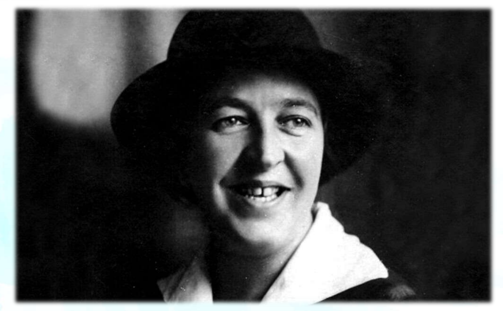
Corrie Ten Boom