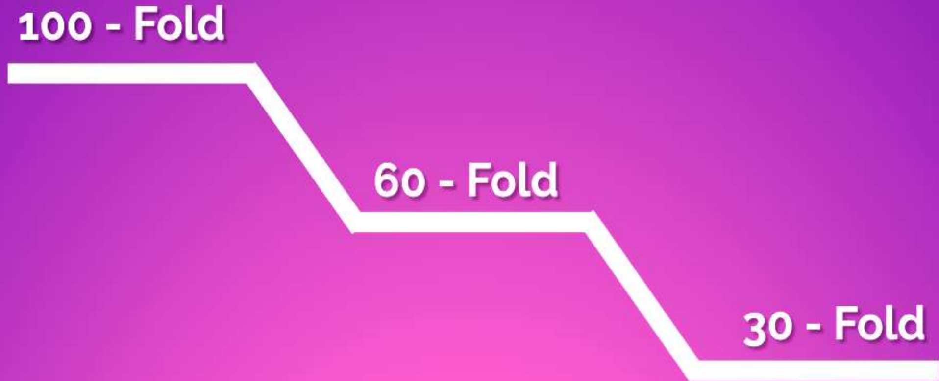
DIAGRAM # 2 – Matthew -100-60-30-fold