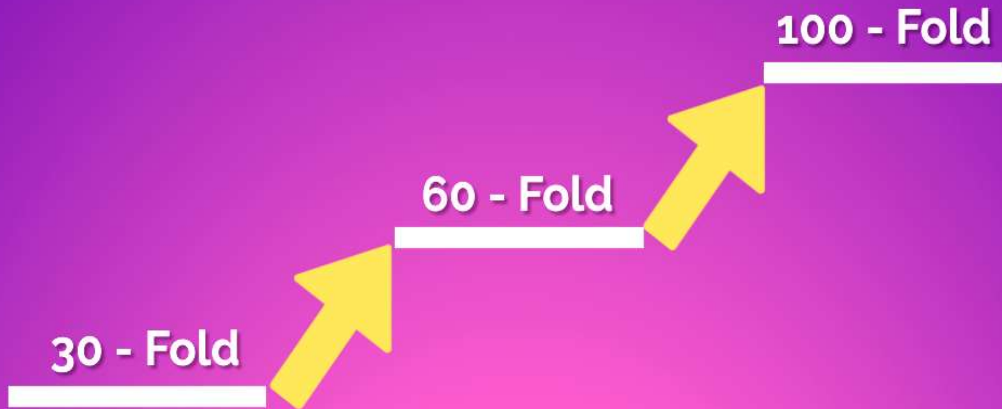
DIAGRAM # 4 - MARK - EXALTATION OF A SERVANT