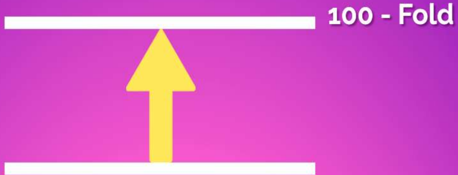
DIAGRAM # 3 - LUKE - 100 fold