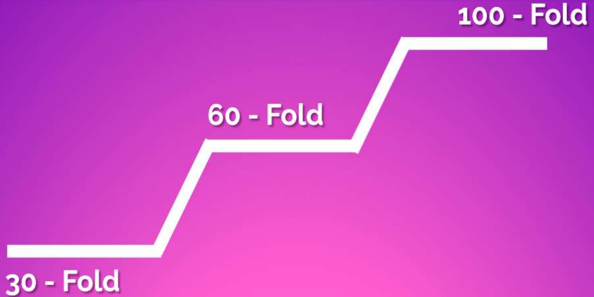
DIAGRAM # 1 – Mark -30-60-100-fold